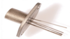
Flange O2 Sensor