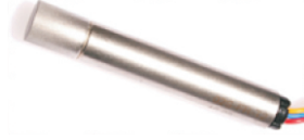
Probe O2 Sensor